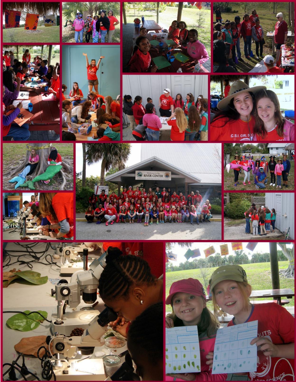
Photos from the Girl Scouts CSI Workshop on January 31.