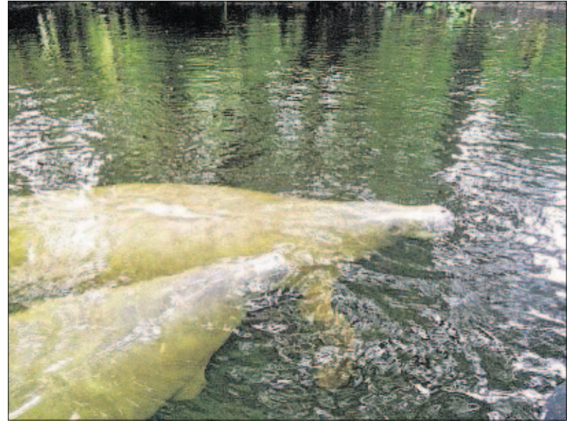
Manatee companions