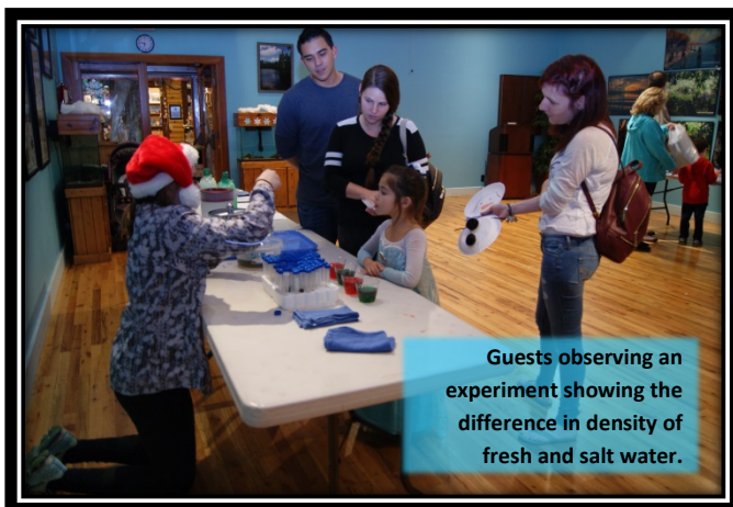
Guests observing an experiment showing the difference in density of fresh and salt water.