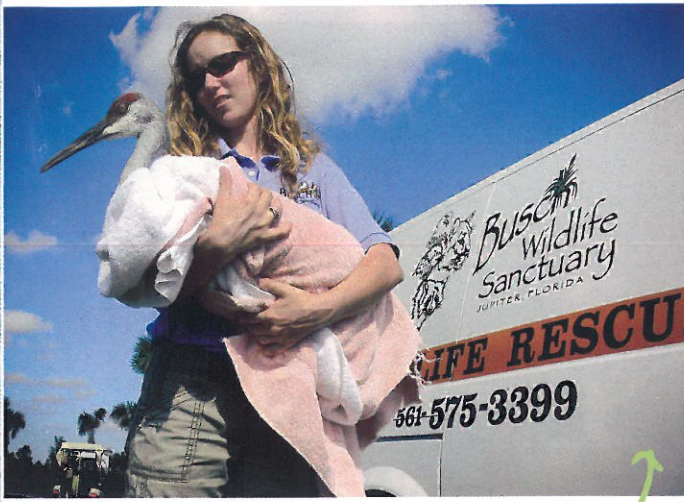
CLOCKWISE FROM LEFT: A BUSCH WILDLIFE SANCTUARY ANIMAL CARE STAFF MEMBER HOLDS AN INJURED SANDHILL CRANE; ONE OF BUSCH WILDLIFE'S RESIDENT FLORIDA PANTHERS; CATCHING A GAME BEHIND THE PLATE AT ROGER DEAN STADIUM; NORTH COUNTY'S WATERY SENTINEL, THE JUPITER INLET LIGHTHOUSE.