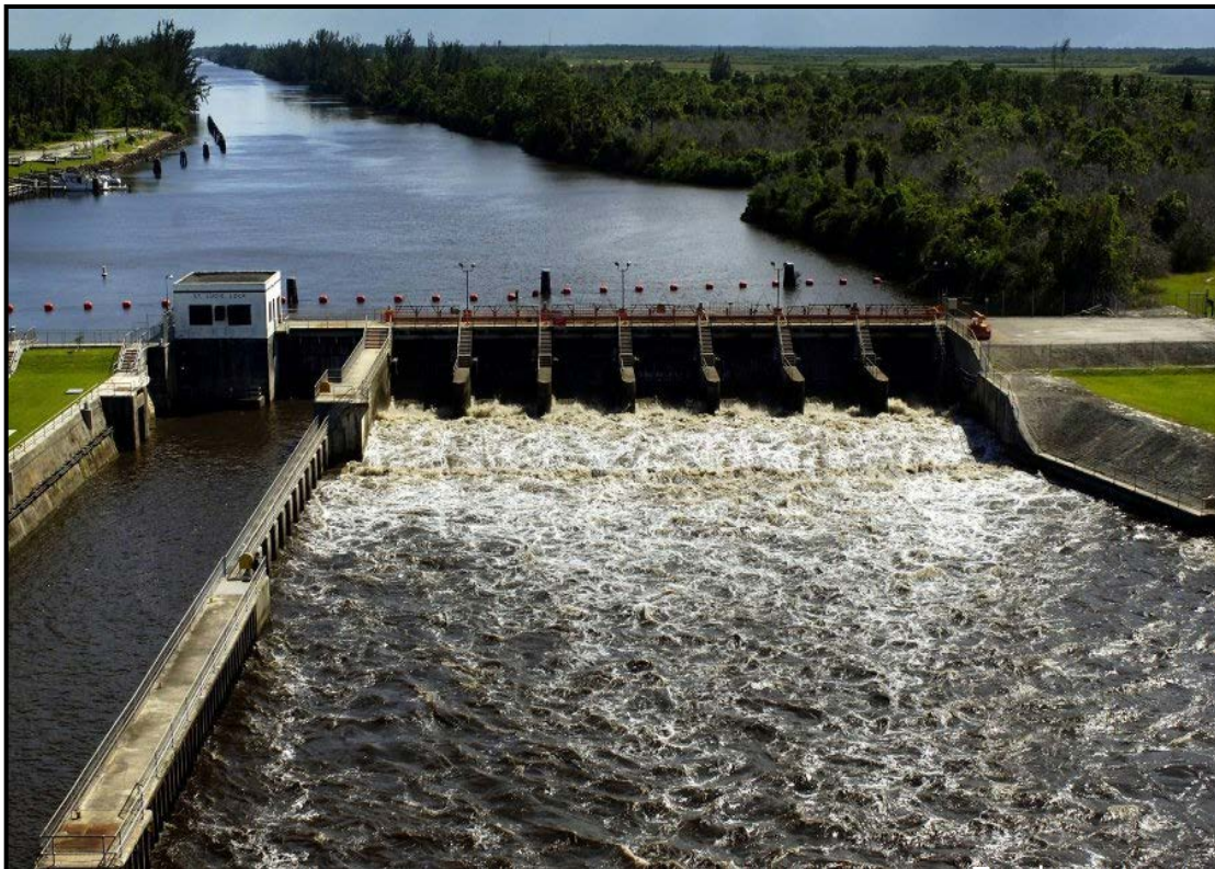
Flood control releases through the S-80 water control structure into the St. Lucie River.