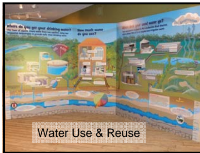
Water Use & Reuse

Graphics for several of the exhibits have been installed by Sparks. Included were Wild and Scenic River, Floodplains, Water Budget, Estuary, Water Use and Reuse, and Seagrasses. The History/Timeline graphic is in